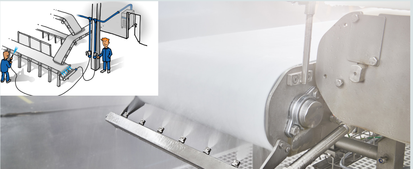
Conveyor belt cleaning in a large slaughter house. In this application the SC DELTA is fed with hot water needed together with high flow and pressure to achieve the desired result. SC DELTA enables several belts being cleaned at the same time